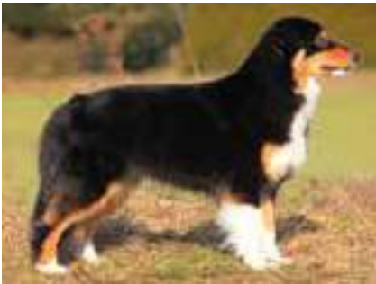
Yukon's great-great-granddaughter CH Clubwinner 2016 Los Perros Locos Cute Flowerpower VT RO-B RO-1 "Kate." Born 2011. By RisingStar Message In A Bottle x Old Kauri Tree Absolutely Cute. (GERMANY)