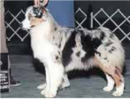
Yukon's daughter AKC CH Thornapple Bedazzled "Dazzle." Born 2000. By Yukon x Thornapple Goddess of The Hunt.