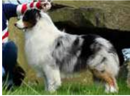
Yukon's great-great-grandson DJCH-Dutch CH Dailo's Running With My Boots On "Frazer." Born 2014. By CH Dailo's Black Label x Dailo's Pocket Full of Sunshine. (NETHERLANDS)