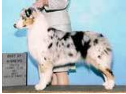
Yukon's double granddaughter AKC-ASCA CH Cedar Hill Bel Ami Park Ave Blues "Parker." Born 2009. By AKC CH Cobbercrest Red Ruffian x Cobbercrest Louisiana Hail Mary.