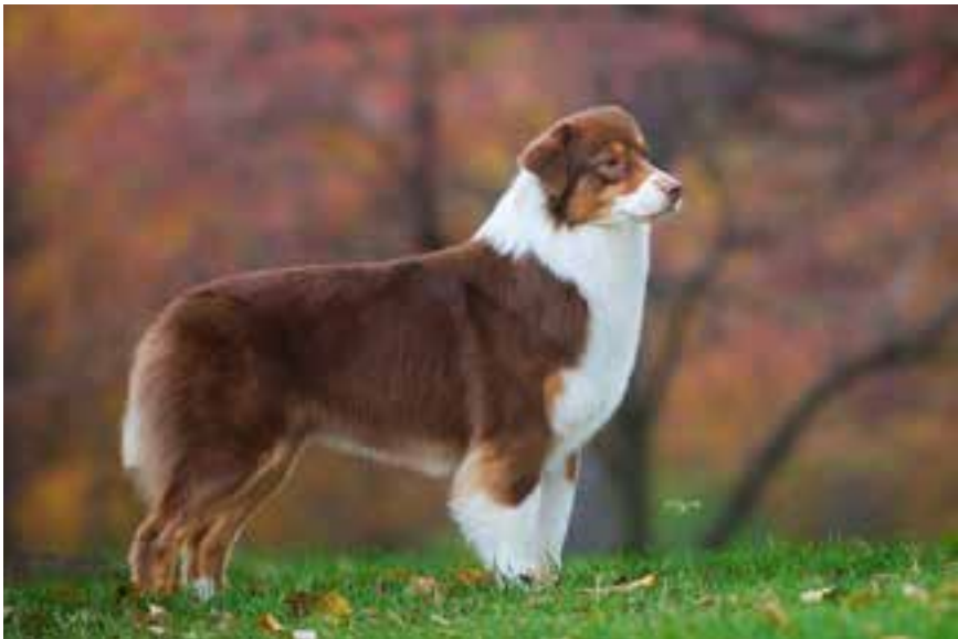
Yukon's great-granddaughter AKC-ASCA CH Lastcall's Test for Echo "Echo." Born 2013. By AKC GCH-ASCA CH Highpoint's Sweet William x ASCA CH Lastcall's Lady in Black CD RV-O JV-E GV-O.