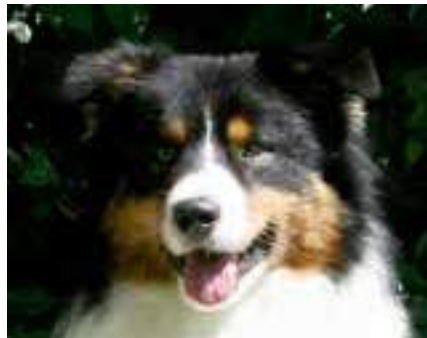
Yukon's grandson VDH CH-Dt CH (Club) ObCH -MVA Mill Creek's Night Flight "Kanoa." Born 2004. VDH Bundessieger 2006/2007/2009. By AKC CH Cobbercrest Ring of Saturn x CH Mill Creek's She'll Be A McMATT. (GERMANY)