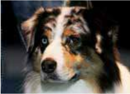
Yukon's great-grandson C.I.B DK CH DKV-10, FIV-10, NORDV-11, SEVV-16 Thornapple Mercury All Jacked Up "Jack." Born 2008. By AKC CH Thornapple All Fired Up x AKC CH Thornapple Straight Up. (SWEDEN)