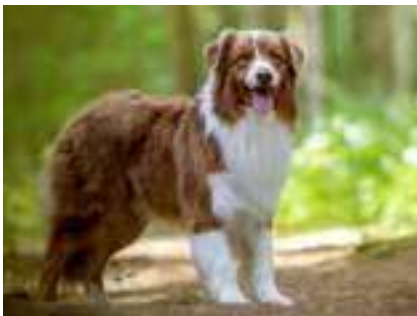
Yukon's great-grandson INT CH Leading Angel's Diamond Afterglow "Coffee." Born 2010. By Multi CH Thornapple Aftershock x Multi CH Thornapple Queen of Diamonds. (GERMANY)