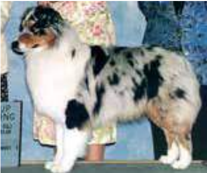
Yukon's paternal grandsire AKC CH Kaleidoscope Case In Point ROM C-III "Casey." Born 1994. Sire of 27 champions.