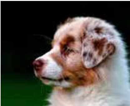
Yukon's granddaughter Lamintone Enchanted Fire "Haze." Born 2017. By AKC-ASCA CH Rainyday's I'm On Fire HT ROM X-III ROM C-I ROM P-I ASCA HOF x Lamintone Its All About Me. (UNITED KINGDOM)