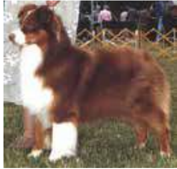
Yukon's son AKC-ASCA CH Rainyday's Preston Phillips "Wally." Born 1999. By Yukon x AKC CH Rainyday's Free As A Bird CGC USASA HOFX-ASCA HOF.