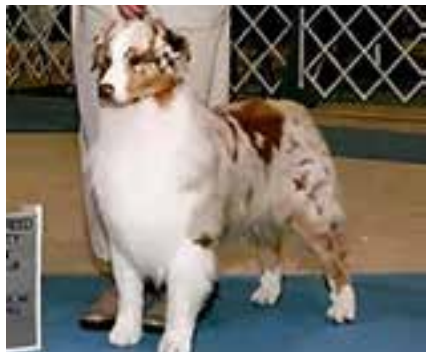
Yukon's son AKC CH Cobbercrest Red Ruffian. "Manny." Born 2000. By Yukon x AKC CH Thornapple's What It Takes.