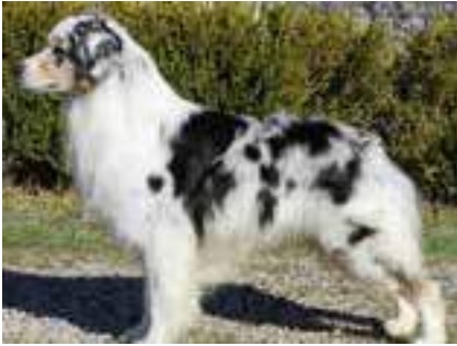
Yukon's grandson Prestige All Charged Up "Kilo." Born 2009. By ASCA CH Spring Fevers Got My Game On x BISS AKC-ASCA CH Stone Ridge She's All That.