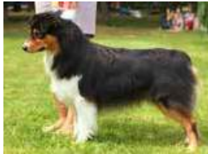
Yukon's great-great-great-grandson Soulwind A Touch of Magic "Oscar." Born 2015. By CH JCH Happy Spark All Fired Up NLJCH, BEJW'13 x CH Los Perros Locos Cute Flowerpower RO-B RO-1 VT CLUBSGR'16 (GERMANY)