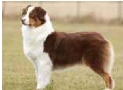
Yukon's great-great-granddaughter Multi CH Leading Angel's Gondola Courtship "Venice." Born 2010. By Multi CH Thornapple Cuba Blue x CH Thornapple Up The Ante. (DENMARK)