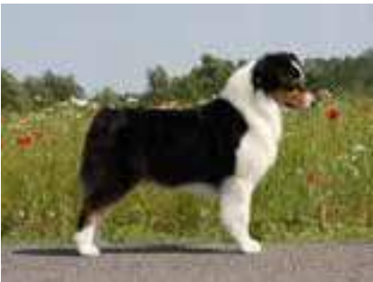
Yukon's granddaughter DNK-NOCH-KLBVE CH KBHVV15 Thornapple Queen of Diamonds "Sycamore." Born 2006. By AKC CH Thornapple King of Diamonds x AKC CH Thornapple Bedazzled. (DENMARK)