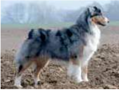
Yukon's son ASCA CH Carolina Calais Get UR Motor Runnin OTDs ATdD RS-N JS-O RN "Huck." Born 2007. By Yukon x AKC-ASCA CH Calais Carolina Mustang Sally. (BELGIUM)