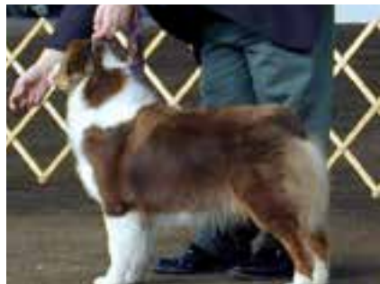
Yukon's daughter ASCA CH Rainday Dawn's Early Light "Rori." Born 1999. By Yukon x Cobbercrest Propwash Obla-De USASA HOFX-ASCA HOF.