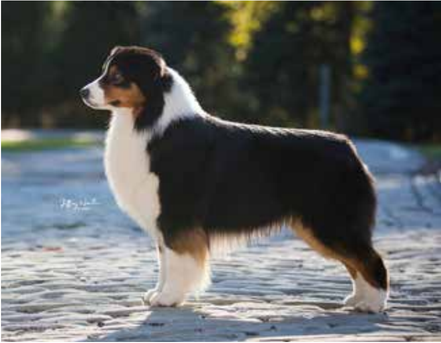
Yukon's great-great-grandson RBIS MBISS AKC Gold GCH-ASCA CH Shadomoons The Competitive Edge RN CA CGC "Trump" Born 2012. By BIS AKC GCH-ASCA CH Equinox The Edge of Reason RE x UKC CH Shenandoah Diamond In The Ruff.