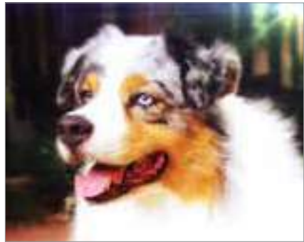
Yukon's great-grandson Multi GCH-Multi CH Hyland's Keylime "Keylime." Born 2007. Caribbean Breed Winner (Guatemala 2011). By CH Sherbil's Hearttrobdesertsy x Hyland's Starlite Starbrite. (EL SALVADOR)