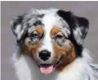
Yukon's great-granddaughter AKC GCH-ASCA CH Rainyday's Wonderful Tonight NAJ RS-N JS-O GS-N "Layla." Born 2016. By AKC-ASCA CH Goldcrest Cameo Captivator x AKC-ASCA CH Rainyday's Eleanor Rigby ROM X-II ROM P-I.