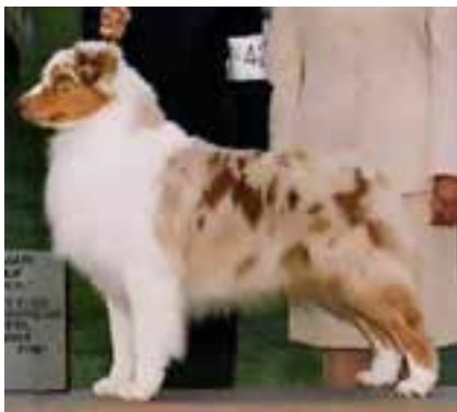
Yukon's son AKC CH Cobbercrest Ring of Saturn "Turner." Born 2000. By Yukon x Cobbercrest Rainyday's Yoko Ono.