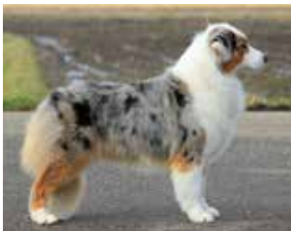
Yukon's great-great-granddaughter DJCH-Dutch CH Dailo's Thinking Out of the Box "Candy." Born 2014. By CH Dailo's Black Label x Dailo's Pocket Full of Sunshine. (NETHERLANDS)