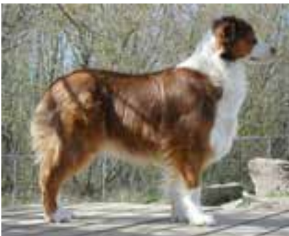
Yukon's great-granddaughter Coultrip's Robin La Rouge "Happy." By AKC CH Echolakes Merlin Rouge x Coultrips Lucille Ball. (CANADA)