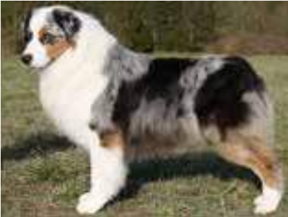
Yukon's great-grandson DNK-NO-PL-INT-KLB CH KBHV15 Leading Angel's Gaze At The Stars "Brad Pitt." Born 2012. By Multi CH Collinswood House Rules x DNK-NOCH-KLBVE CH KBHVV15 Thornapple Queen of Diamonds. (DENMARK)