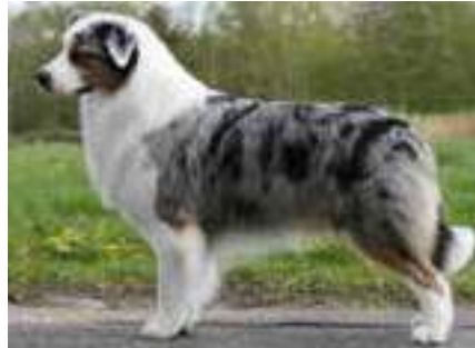
Yukon's double great-grandson DNK-PL CH Leading Angel's Diamond Shockwave "Shahen." Born 2010. By AKC-DNK-GBR-NOR-DEU CH Thornapple Aftershock x DNK-NOCH-KLBVE CH KBHVV15 Thornapple Queen of Diamonds. (DENMARK)