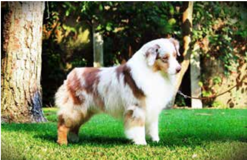
Yukon's great-grandson Multi BIS, Multi CH Risingstar's Billion Dollar Baby "Christoff." Born 2011. By AKC GCH CH-ASCA CH Two By Two's The Pipes Are Piping x CH Risingstar's Sugar 'N Spice. (EL SALVADOR)