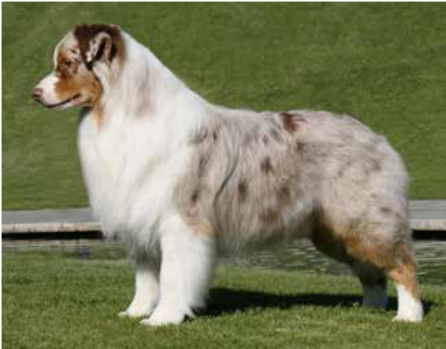
Yukon's grandson AKC-DNK-GBR-NOR-DEU CH Thornapple Aftershock "Diablo." Born 2003. WW 2008, VWW 2012, Crufts W 2007, 2008, 2011, 3 x DK W 2006, 2007, 2009. By CH Ragtime's Light It Up x AKC CH Thornapple Silken Flame. (DENMARK)

Yukon was a great sire whose sons and daughters also became outstanding sires and dams of the next generation. Yukon's name can be found in the pedigrees of many Australian Shepherds in conformation show rings today, both in the United States and abroad.