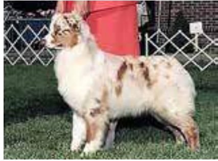
Yukon's daughter AKC CH Thornapple Silken Flame "Halle." Born 2000. By Yukon x Thornapple Goddess of The Hunt.