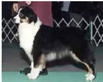
Yukon's daughter AKC CH Thornapple Kahlua N Cream "Kahlua." Born 2000. By Yukon x Paradox Ponder This.