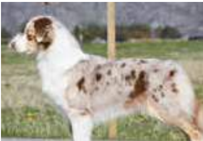
Yukon's great-great-granddaughter BISS NUCH Illumineer Wonderful M "Kiera." Born 2013. By Multi CH Leading Angel's Esteemed Thornapple RN RA HT PT x DKCH DKRLCH Bayshore Stonehaven Vanilla Twilight RN RA LP1. (NORWAY)