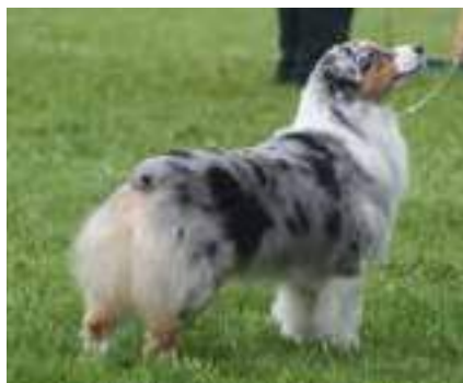
Yukon's great-great-granddaughter CKC BIS GCH Starwoods Exclusive Affair RE CD "Ziva." Born 2010. By AKC GCH Briarbrooks All Rights Reserved x CKC CH Starwoods Focus On A Dream RN.