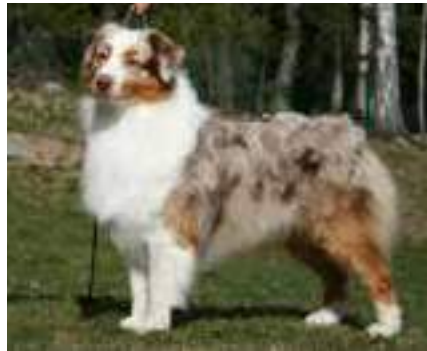
Yukon's daughter Thornapple Moon On Fire "Lunar." Born 2004. By Yukon x CH Thornapple Honey I'm Home. (SWEDEN)